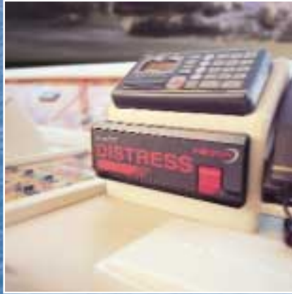
Instant access to emergency services – anytime anywhere

The entire communications system can be overruled by rescue authorities anywhere in the world. By virtue of a pre-emption facility, emergency services can always get through – even when voice or data channels are in use.